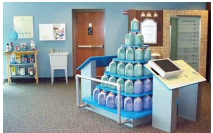
Visit The Aquary to learn how much water we use and what can and cannot be poured down the drain.

your source water and how you can help protect it, too. The exhibits are interactive and geared for all ages, so bring the young-uns, and the teens. The Aquary is open to the public Monday through Friday from 8:30 am to 5:00 pm. No appointment is needed, unless you'd like a staff person available to answer questions. If so, give us a call at 571.291.7880.