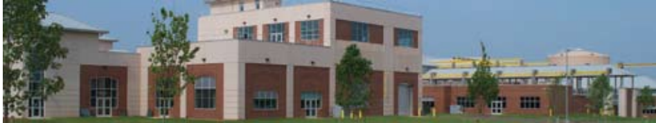
Broad Run Water Reclamation Facility

Loudoun can be proud of many historic accomplishments. We were a temporary safe haven for the Constitution and Declaration of Independence during the War of 1812; James Monroe penned the Monroe Doctrine here in 1823; and we have created a unique blend of technology sectors that neighbor old railroad tracks turned nature trails and historic preservations. Now, we can add two more historic moments to that list. The first is that Loudoun now has next generation water reclamation technology, right in your backyard. The Broad Run Water Reclamation Facility at our new campus off Loudoun County Parkway in Ashburn employs a unique combination of proven reclamation technologies: membranes for ultrafiltration, granular activated carbon and ultraviolet light for disinfection. No other facility in this country does the same. This unique and powerful combination enables us to reclaim your wastewater to the highest level technology is capable of, so that we may return it to the environment in a way that actually improves the environment. The water we release to Broad Run will improve local water quality and eventually, the Potomac River and Chesapeake Bay. The reclaimed water is also suitable for nonpotable beneficial uses, such as irrigation.