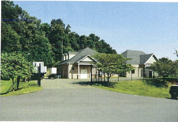
Rendering of future Selma Water Plant

Project Description: This project includes a new treatment building at the Selma Water Treatment Plant site; a new pump station at the Raspberry Water treatment plant site; and ancillary well site and distribution system improvements in Raspberry Falls Selma Estates. The images below are provided for reference.